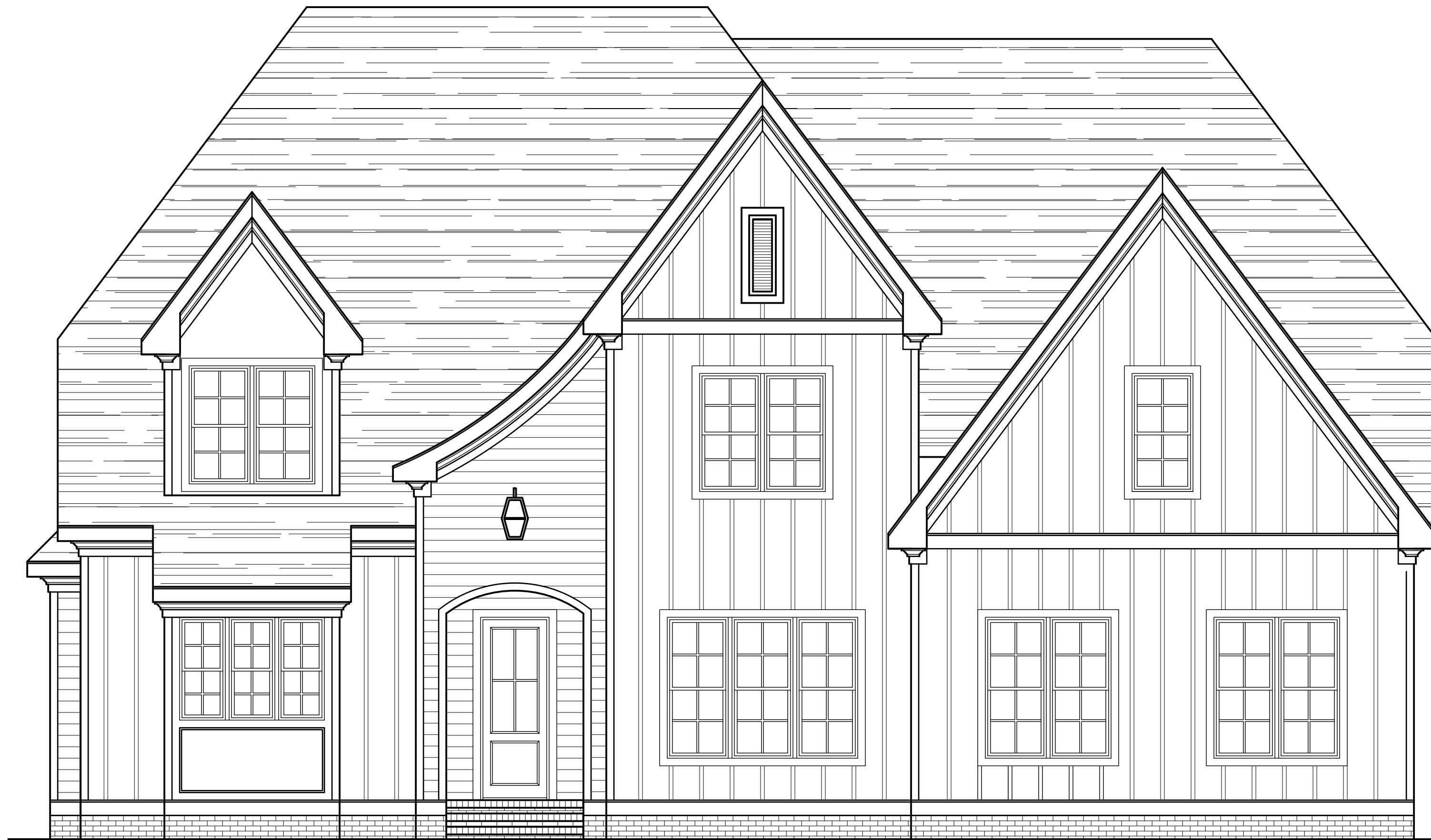
FRONT ELEVATION SCALE 1/4"=1'-0"

NOTE: ALL DIMENSIONS ARE TO BE VERIFIED BY OWNER/BUILDER BEFORE CONSTRUCTION BEGINS. ONCE CONSTRUCTION HAS BEGUN, DESIGNER IS RELEASED FROM ANY AND ALL LIABILITY ASSOCIATED WITH THE CONSTRUCTION OF THIS CUSTOM RESIDENCE. THIS PLAN IS DESIGNED UNDER THE 2018 NORTH CAROLINA RESIDENTIAL CODE