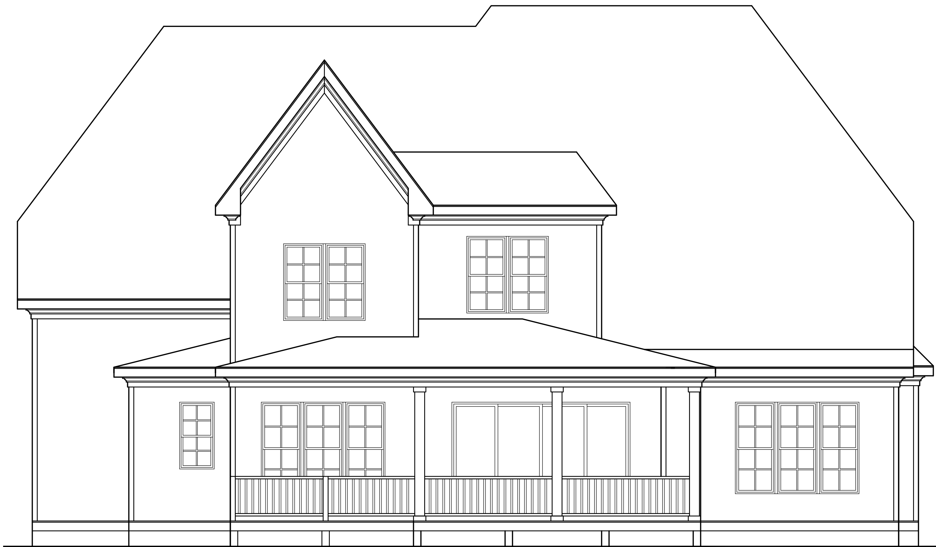
REAR ELEVATION SCALE 1/4"=1'-0"