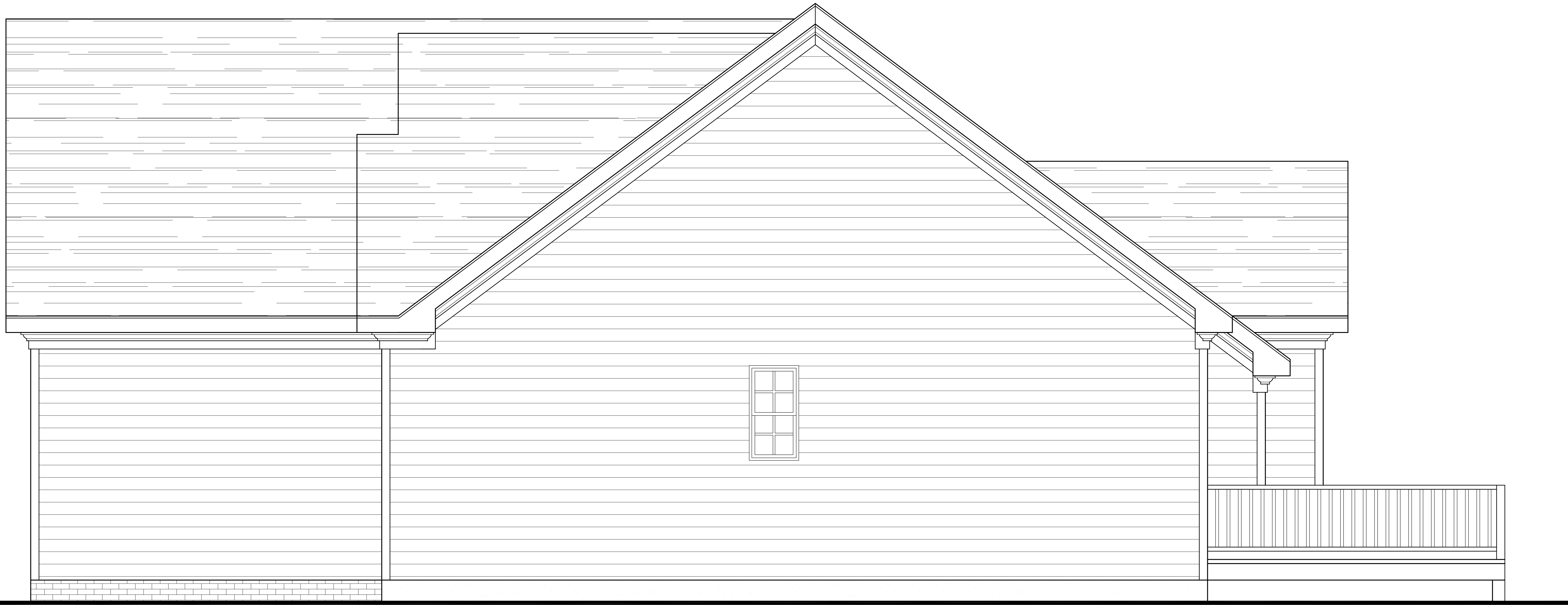
PROPOSED RIGHT ELEVATION SCALE: 1/4"=1'-0"