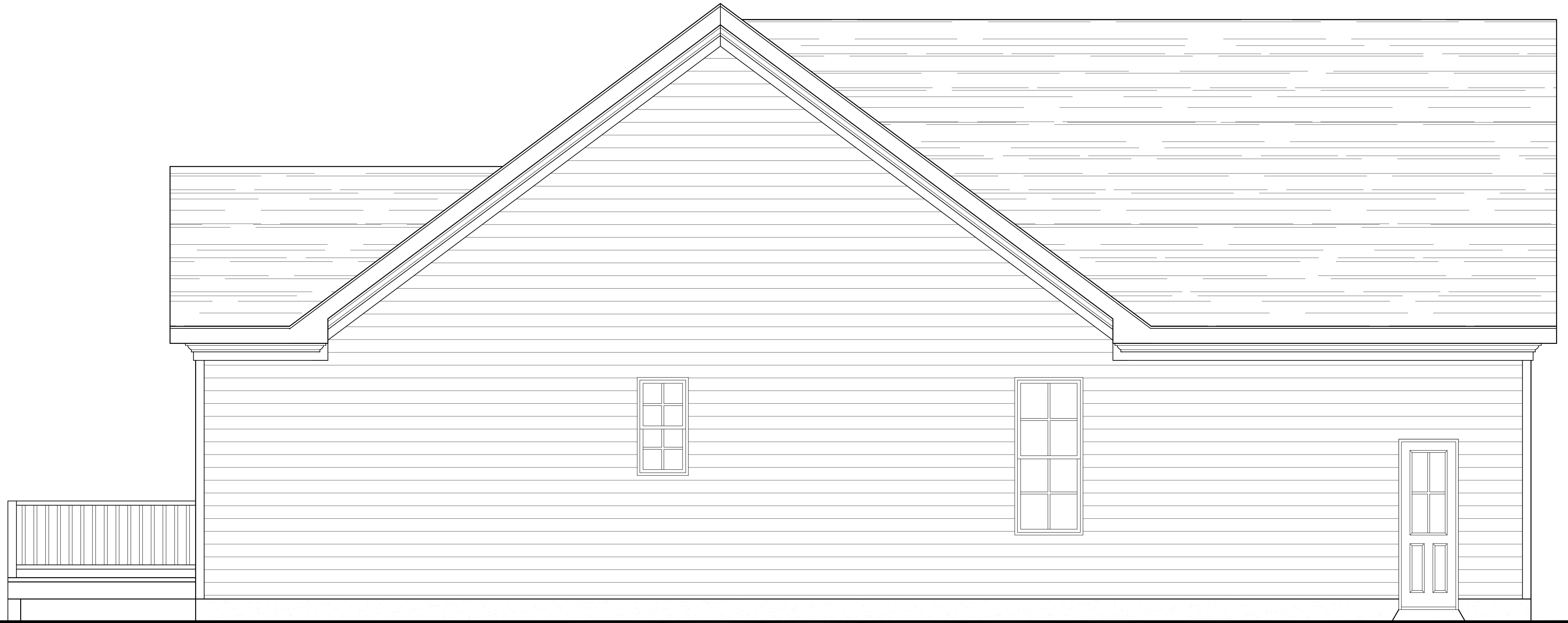
PROPOSED LEFT ELEVATION SCALE: 1/4"=1'-0"