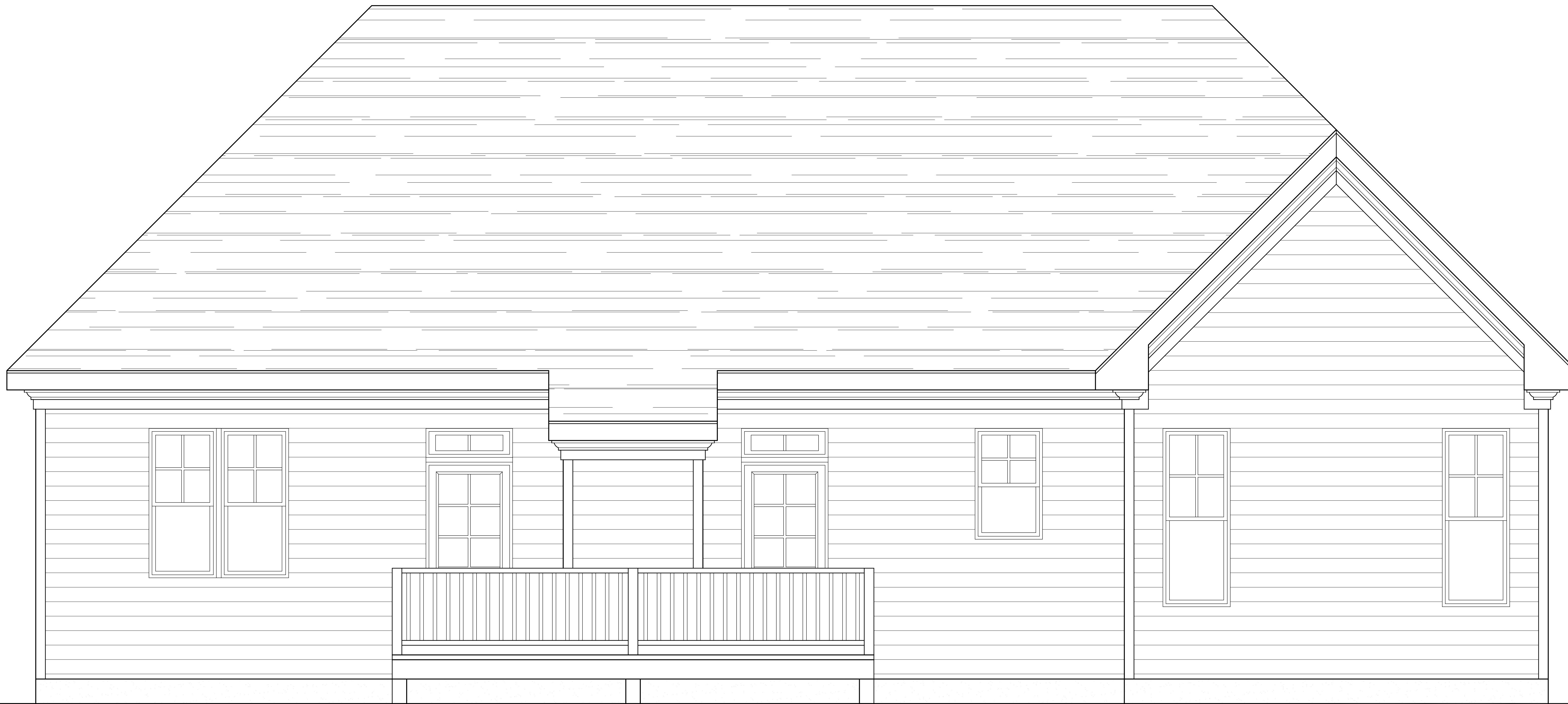
PROPOSED REAR ELEVATION SCALE: 1/4" = 1'-0"