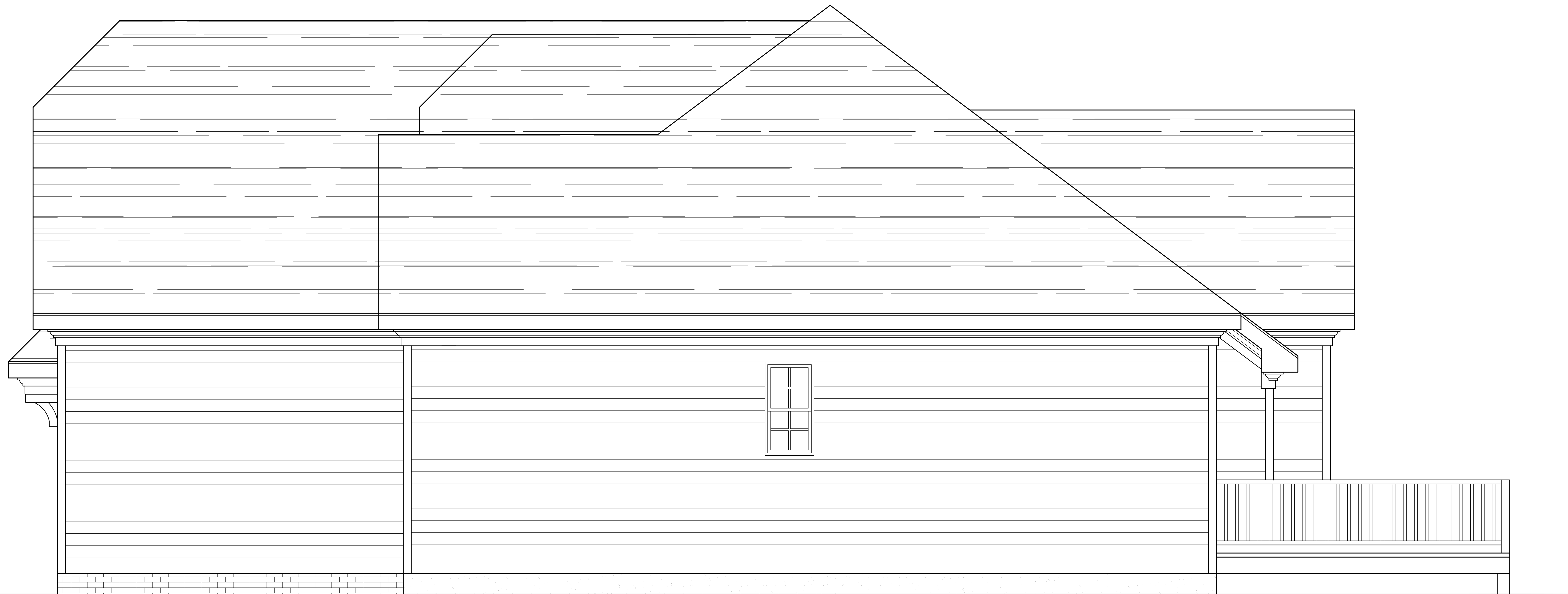
PROPOSED RIGHT ELEVATION SCALE: 1/4" = 1'-0"