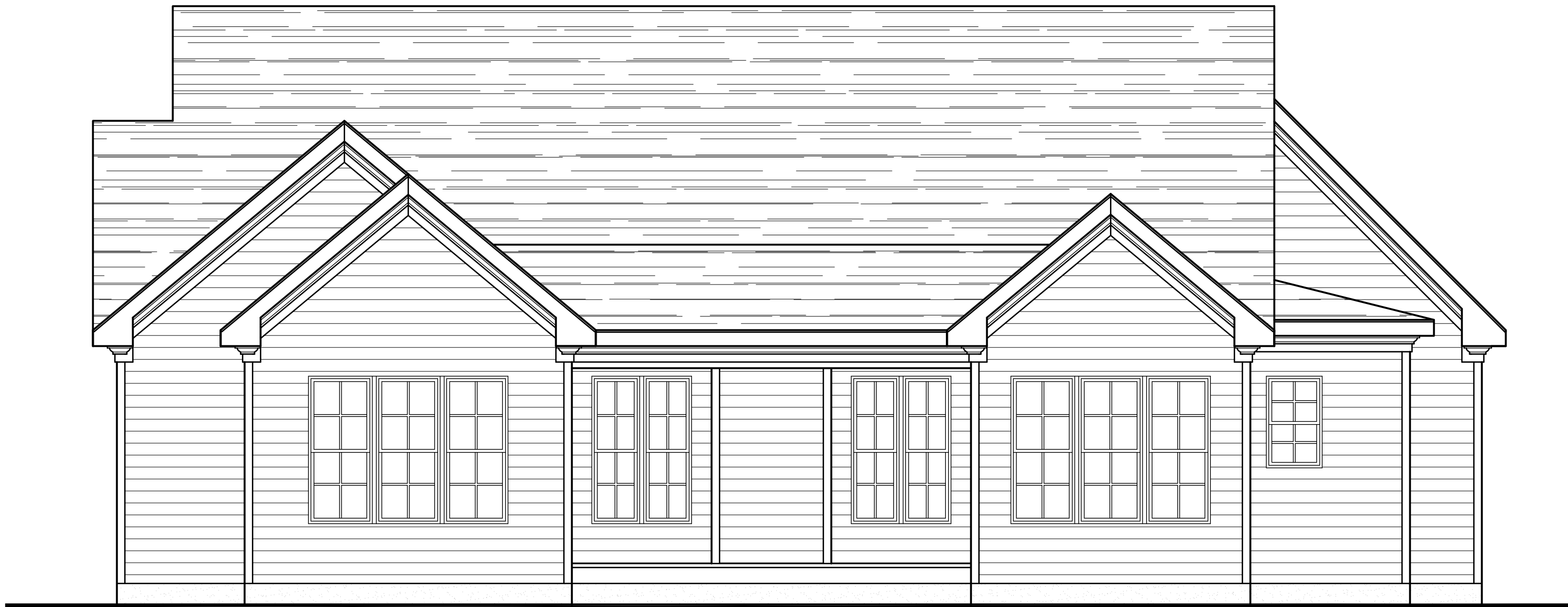
PROPOSED REAR ELEVATION SCALE: 1/4"=1'-0"

ALL DIMENSIONS ARE TO BE VERIFIED BY OWNER/BUILDER BEFORE CONSTRUCTION BEGINS. ONCE CONSTRUCTION HAS BEGUN, DESIGNER IS RELEASED FROM ANY AND ALL LIABILITY ASSOCIATED WITH THE CONSTRUCTION OF THIS CUSTOM RESIDENCE. THIS PLAN IS DESIGNED UNDER THE 2018 NORTH CAROLINA RESIDENTIAL CODE