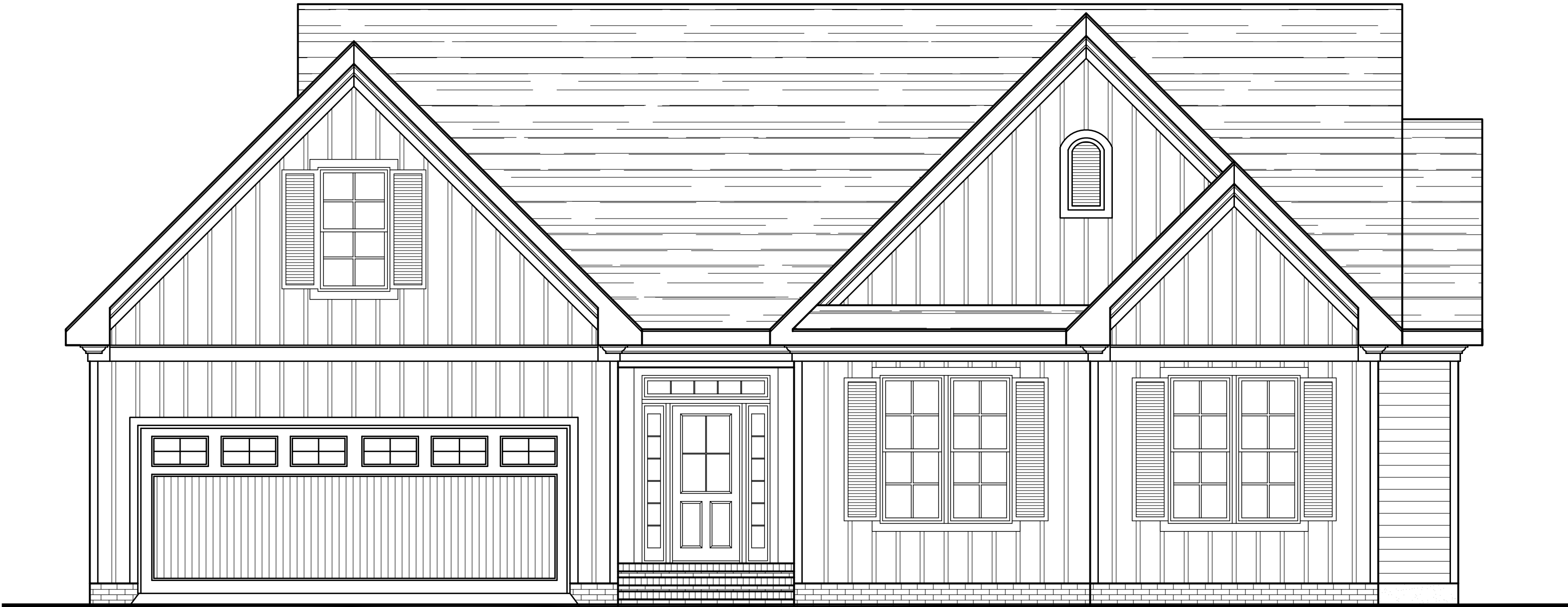
PROPOSED FRONT ELEVATION SCALE: 1/4"=1'-0"

ALL DIMENSIONS ARE TO BE VERIFIED BY OWNER/BUILDER BEFORE CONSTRUCTION BEGINS. ONCE CONSTRUCTION HAS BEGUN, DESIGNER IS RELEASED FROM ANY AND ALL LIABILITY ASSOCIATED WITH THE CONSTRUCTION OF THIS CUSTOM RESIDENCE. THIS PLAN IS DESIGNED UNDER THE 2018 NORTH CAROLINA RESIDENTIAL CODE