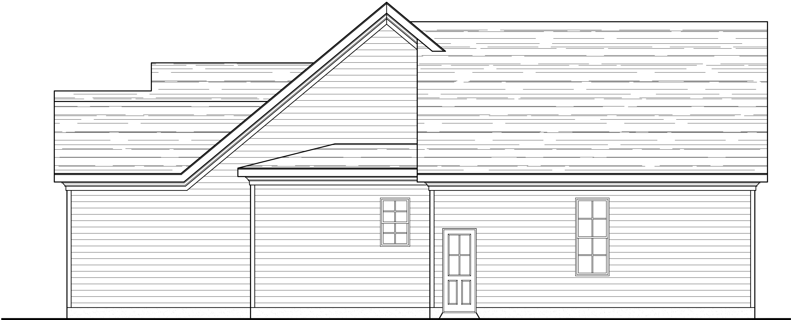
PROPOSED LEFT ELEVATION SCALE: 1/4"=1'-0"

ALL DIMENSIONS ARE TO BE VERIFIED BY OWNER/BUILDER BEFORE CONSTRUCTION BEGINS. ONCE CONSTRUCTION HAS BEGUN, DESIGNER IS RELEASED FROM ANY AND ALL LIABILITY ASSOCIATED WITH THE CONSTRUCTION OF THIS CUSTOM RESIDENCE. THIS PLAN IS DESIGNED UNDER THE 2018 NORTH CAROLINA RESIDENTIAL CODE